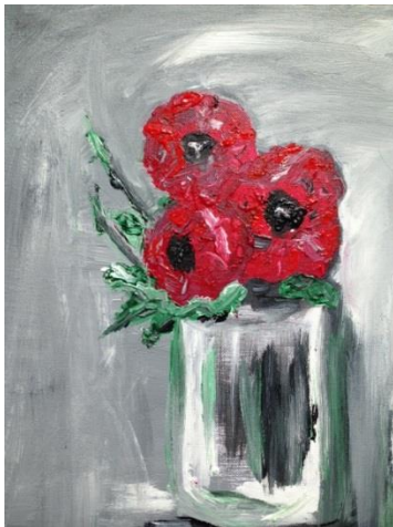
Above – Another of his recent paintings, Valentine