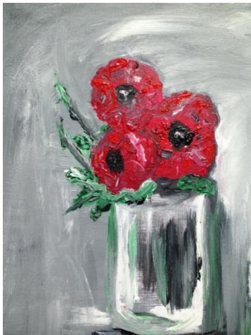
Above – Another of his recent paintings, Valentine